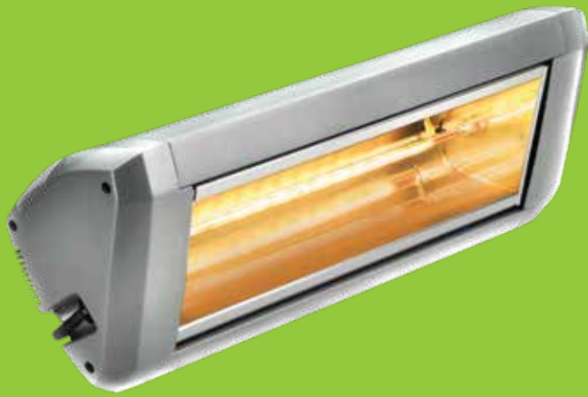
ATC Sienna Low Glare IP55 Heater